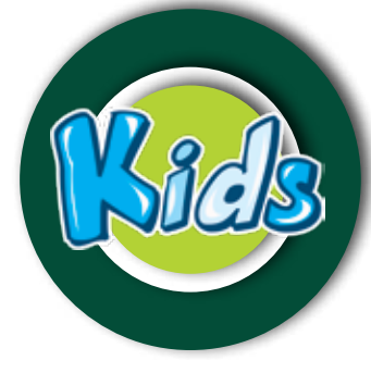
Children from 8 - 13